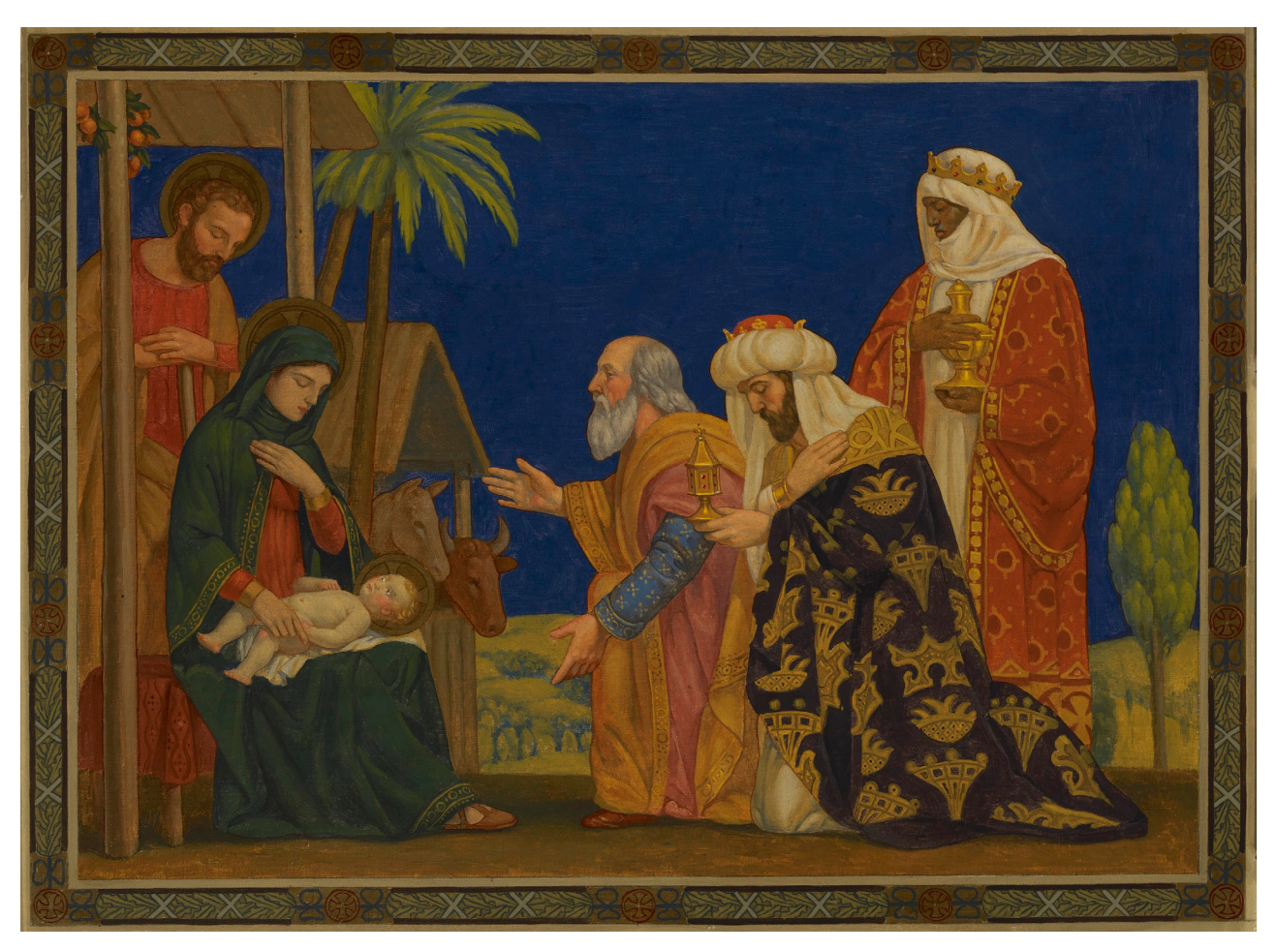
Henry Siddons Mowbray, "The Magi" 1915