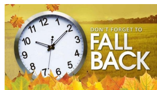
On November 5th